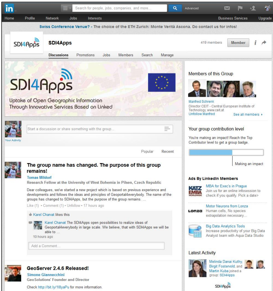
Figure 2 SDI4Apps Linked-In group